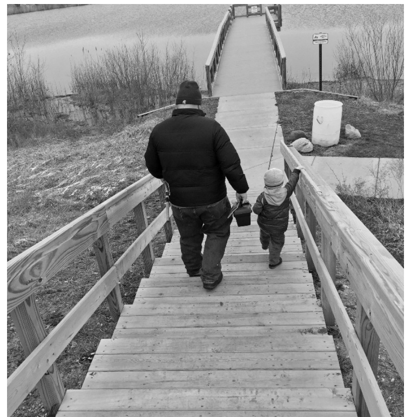
Many anglers are anxious to head out this weekend for several Michigan fishing seasons that open Saturday, April 30.

The Michigan Department of Natural Resources would like to remind anglers to dust off their fishing gear and get ready for the opening of two fishing seasons Saturday, April 30. The statewide trout season and the Lower Peninsula inland walleye, northern pike and muskellunge seasons all open that day.