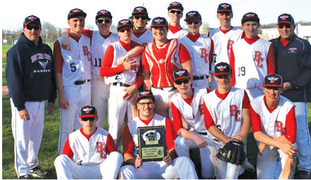
The Boyne City baseball team proudly poses with their Dome Classic Championship trophy that they earned for the second straight year.